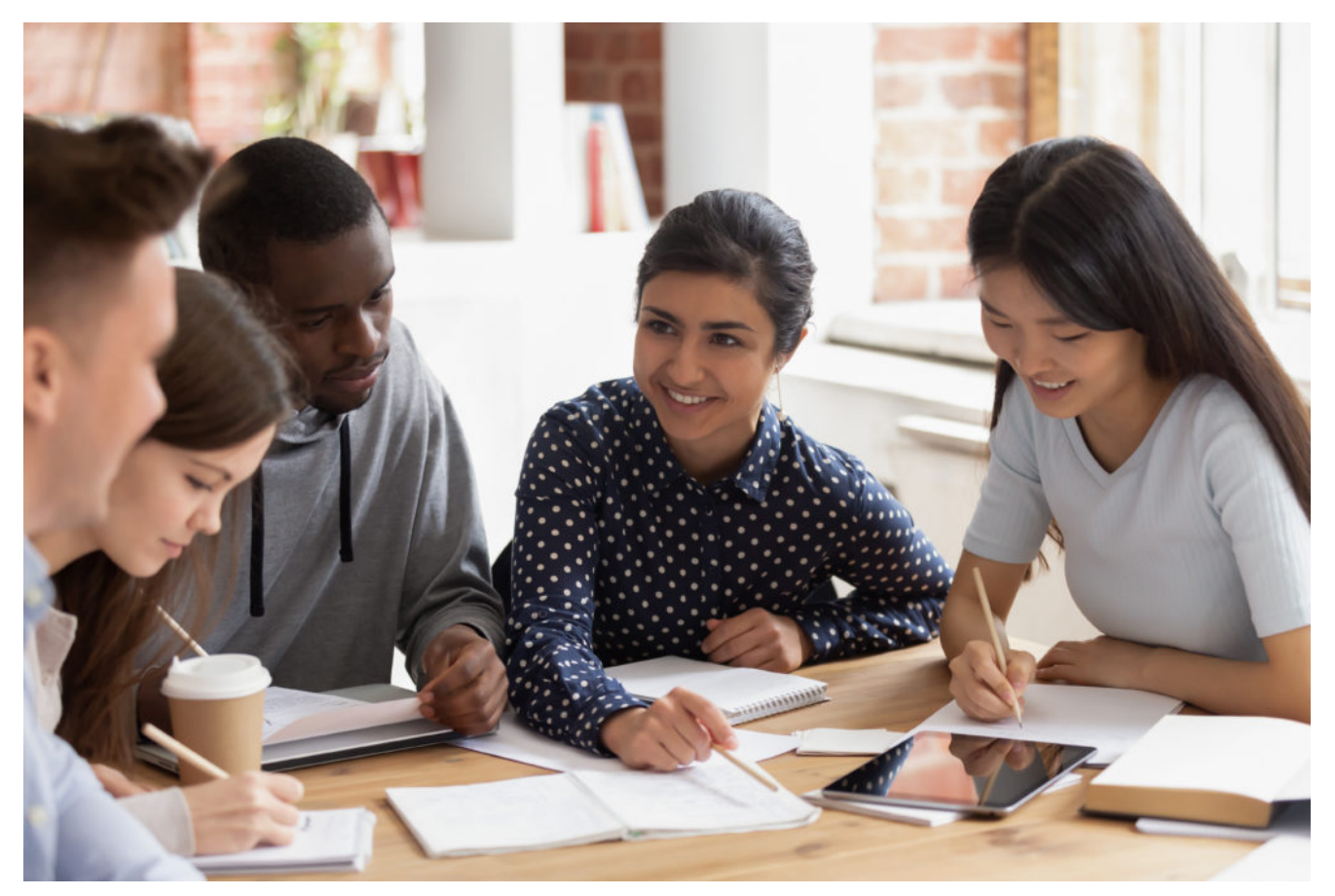
This article was originally published in the February 2023 edition of Story Monsters .®

For over 30 years, CHARACTER COUNTS! has worked with parents, educators, and coaches around the world to help them instill the Six Pillars of Character- trustworthiness, respect, responsibility, fairness, caring, and citizenship-in their students. These values serve as the foundation for our work, whether in kindergarten classrooms, middle schools, high school sports, or in the home.